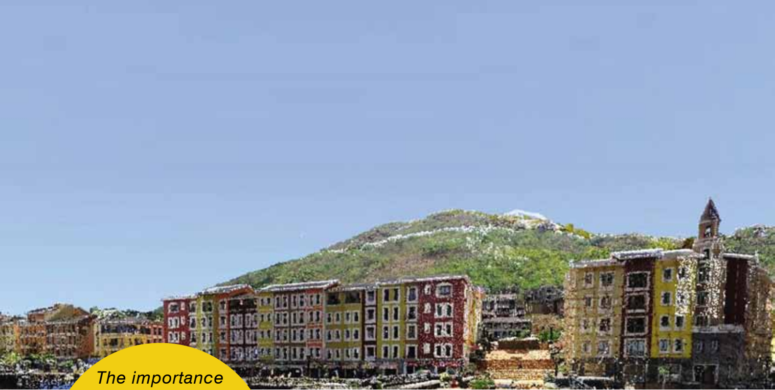
Mapping Project at Lavasa

The importance of geo data will be increasingly realised in the coming years and your Company is well positioned for the same.